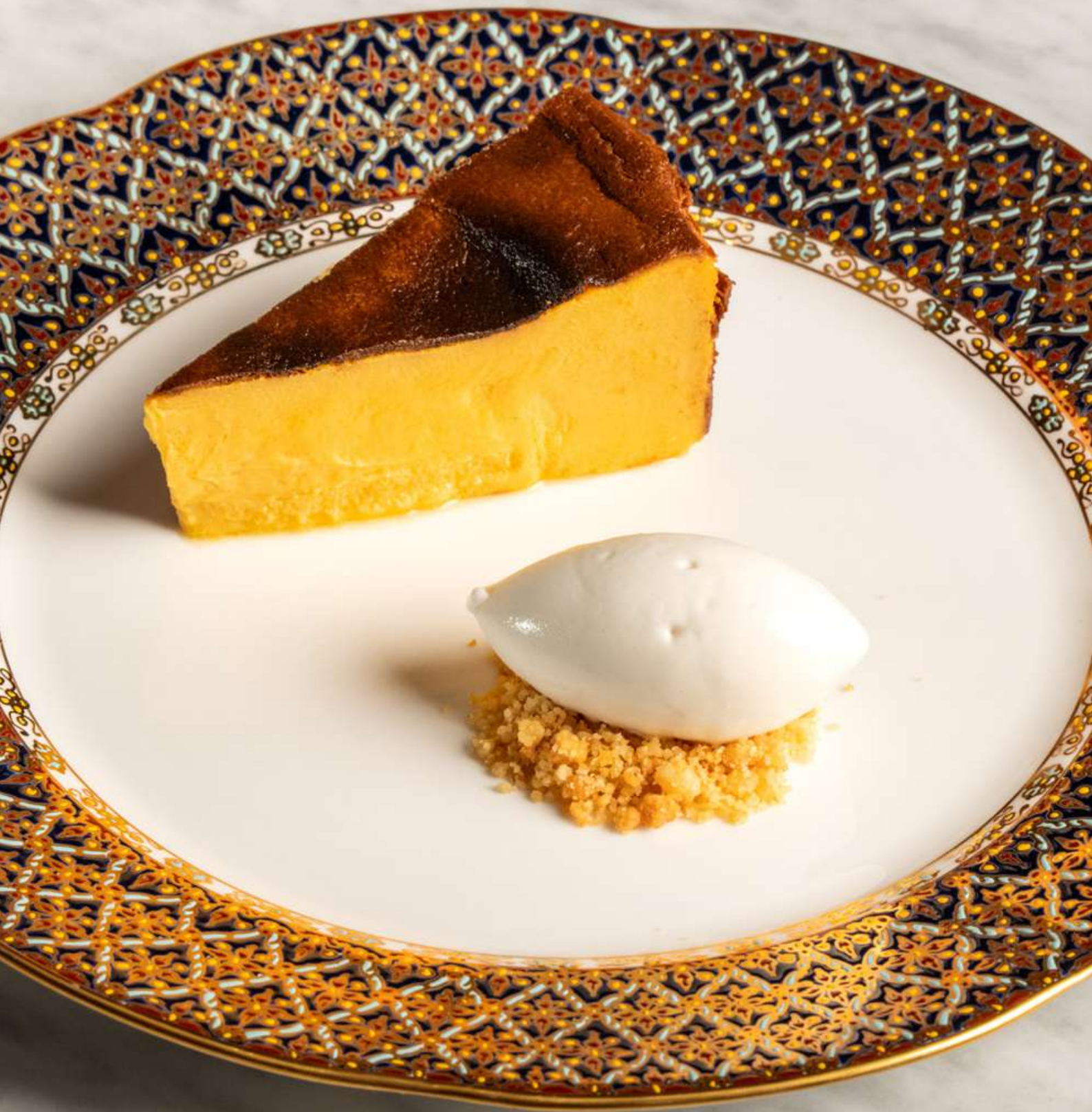
Kanom Mor Gaeng บาสักชีสเค้กขนมหม้อแกง 230