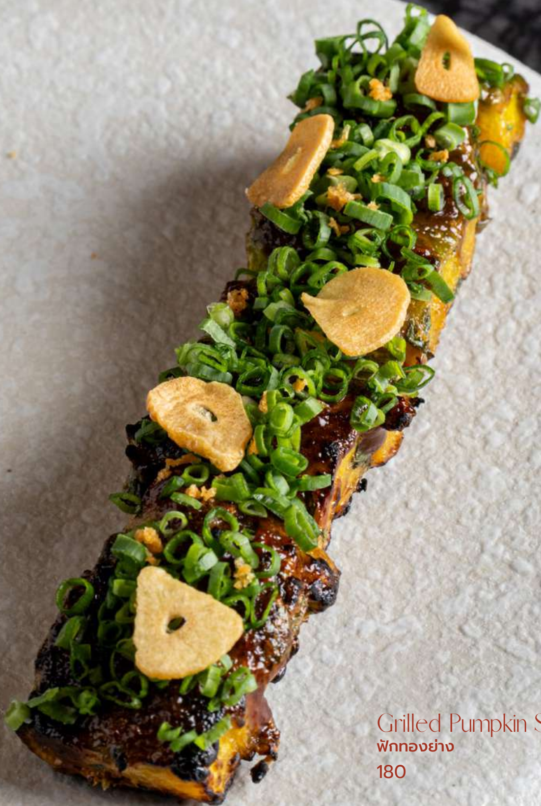
Grilled Pumpkin Skewers พริกทอดย่าง 180