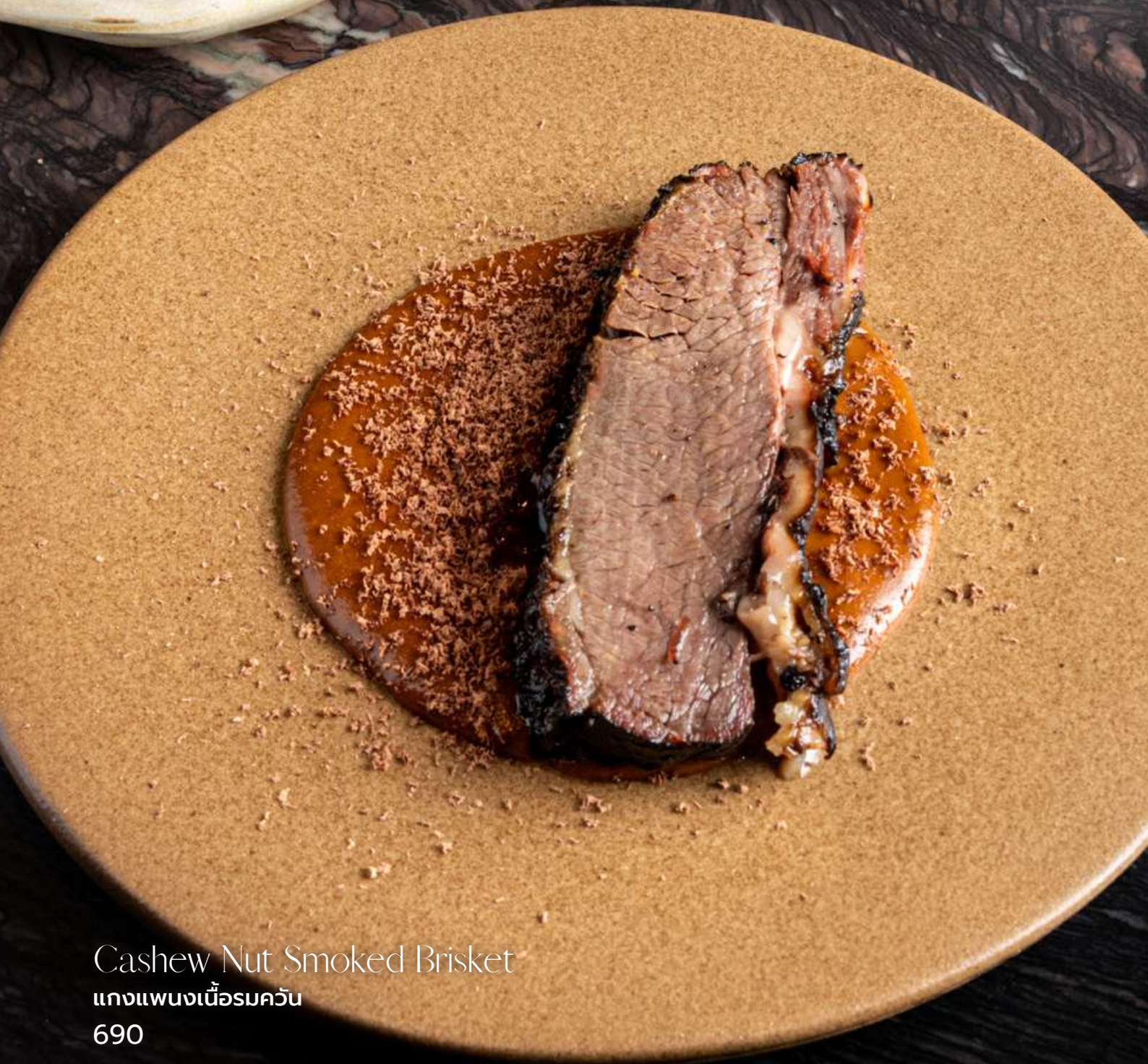
Cashew Nut Smoked Brisket