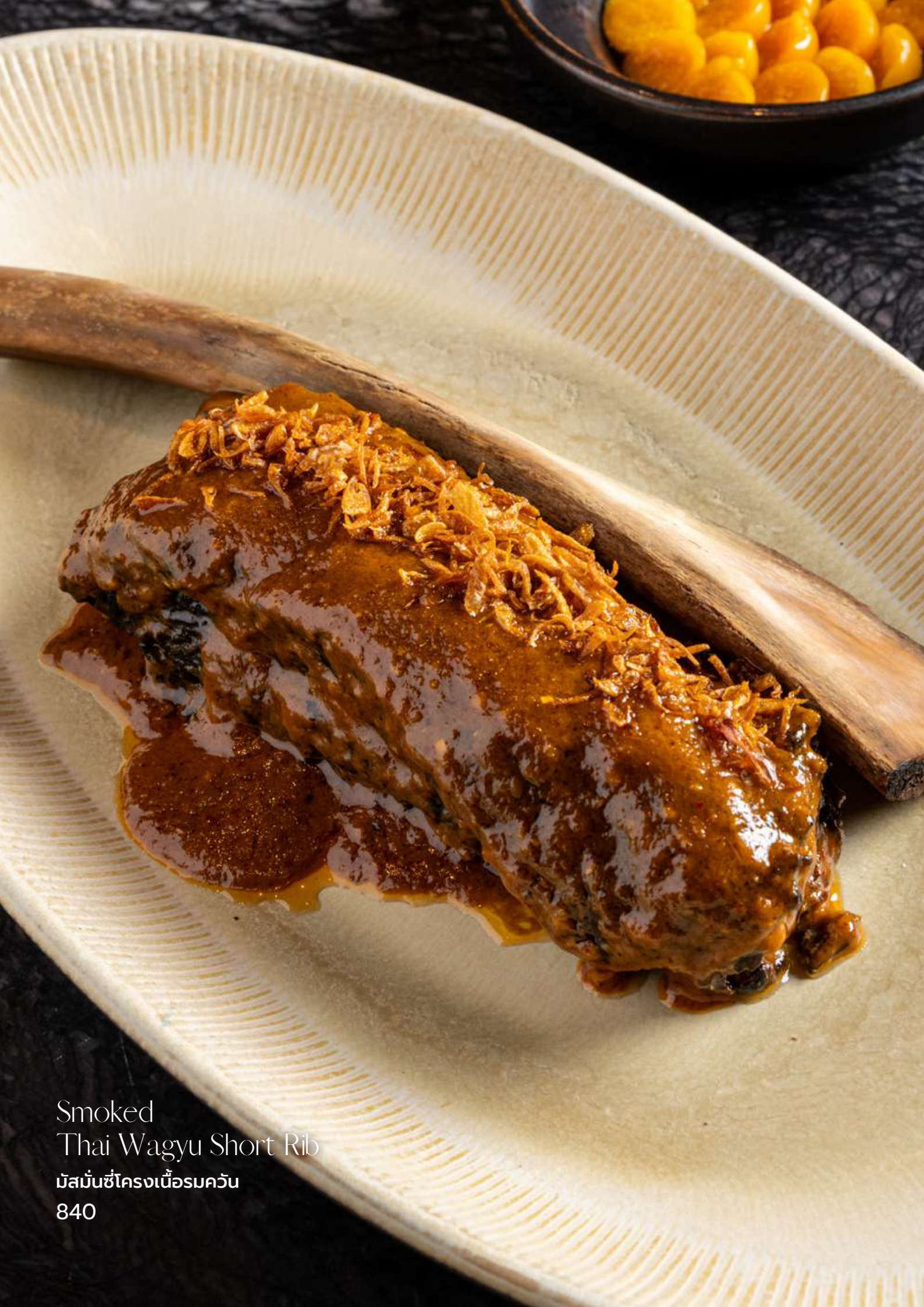
Smoked Thai Wagyu Short Rib