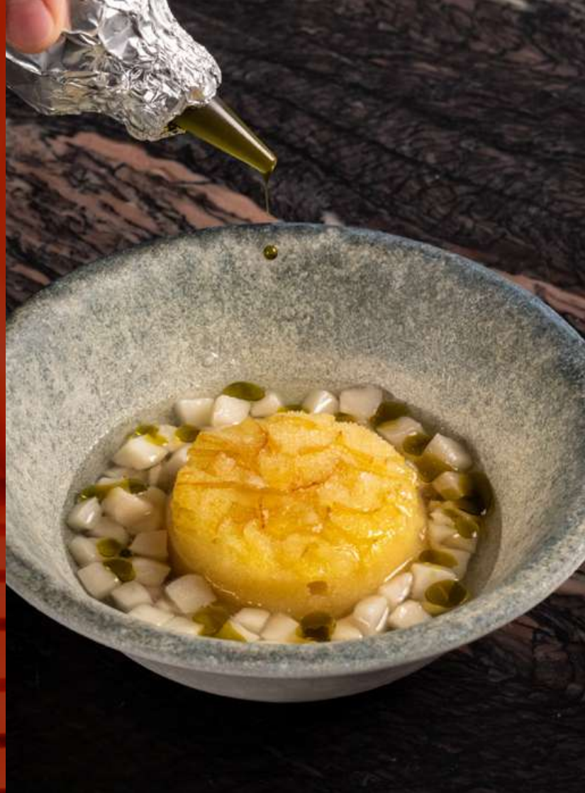
Banana Rum Baba กล้วยรัมบาท 240