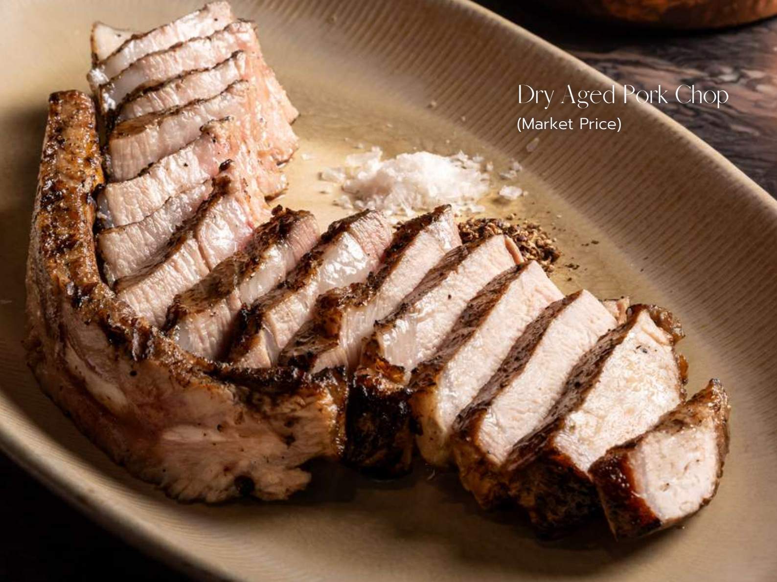
Dry Aged Pork Chop (Market Price)