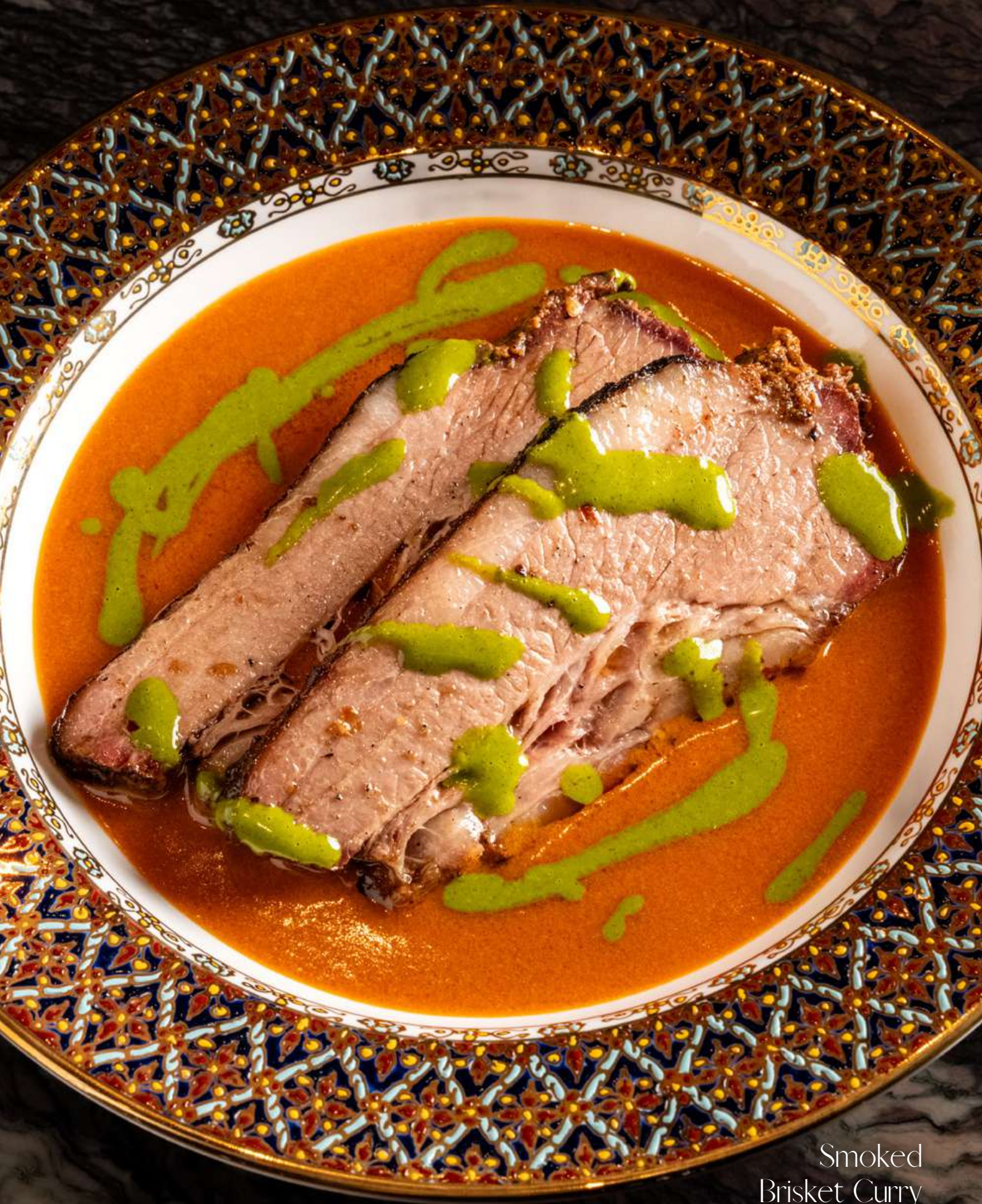
Smoked Brisket Curry แกงมะเขือเนื้อรมควัน 690