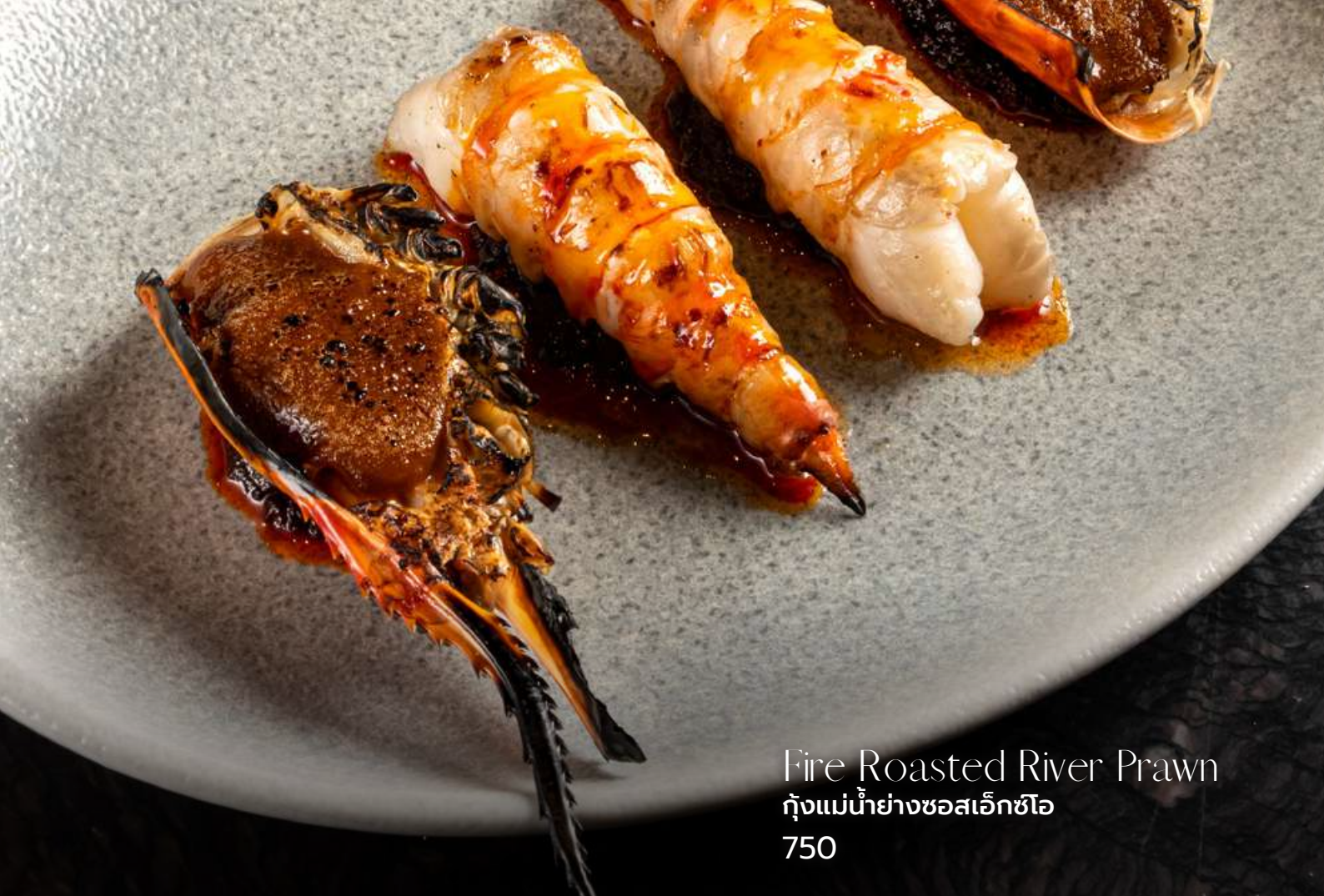
Fire Roasted River Prawn กุ้งแม่น้ำย่างซอสเอ็กซีโอ 750