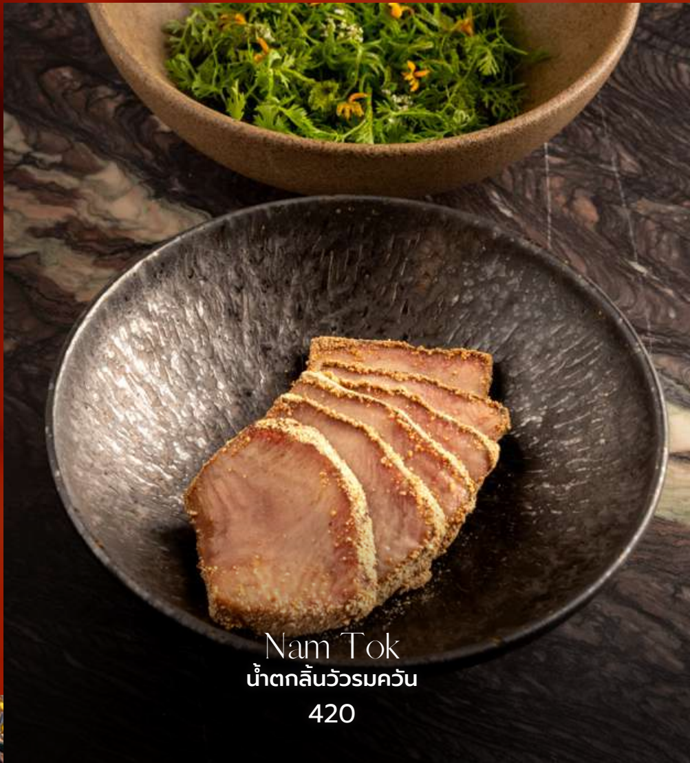
Nam Tok น้ำตกลิ้นวอร์มควน 420