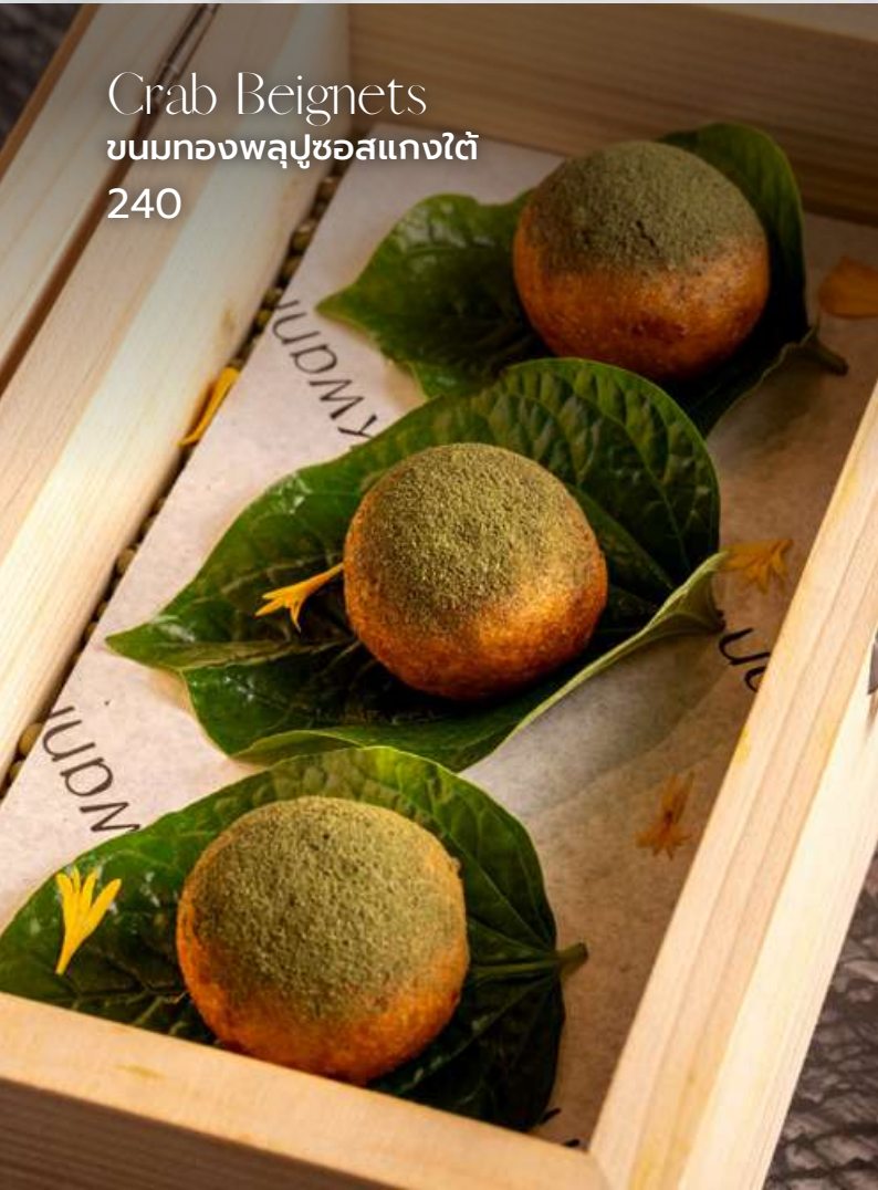
Crab Beignets ขนมทองพลุปูซอสแกงใต้ 240