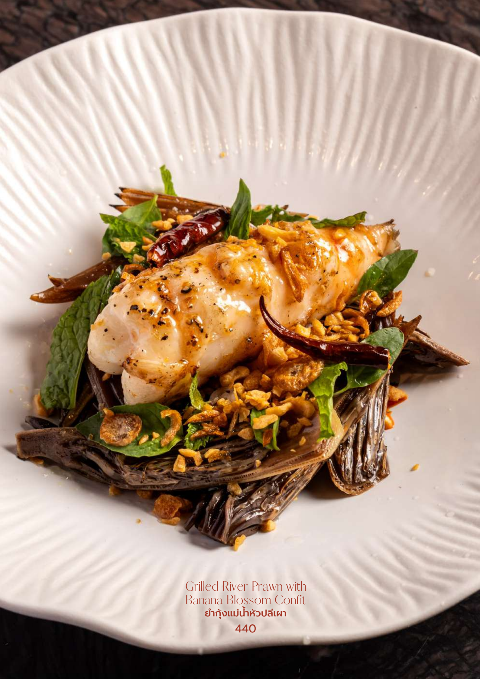
Grilled River Prawn with Banana Blossom Confit ยำกุ้งแม่น้ำหิวปลีเผา