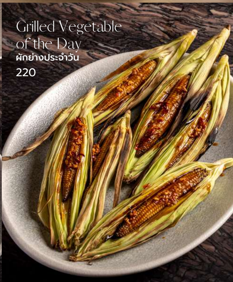
Grilled Vegetable of the Day ผักย่างประจำวัน 220