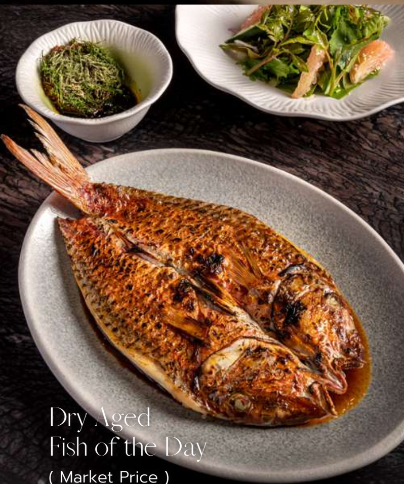
Dry Aged Fish of the Day ( Market Price )