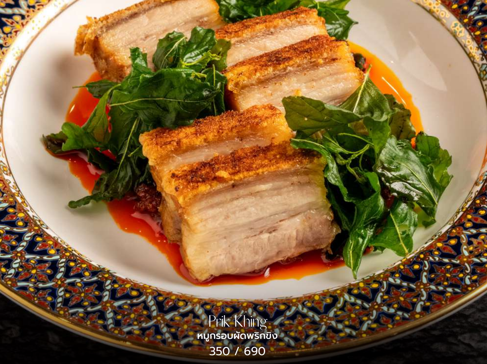
Prik Khing หมูกรอบพริกขี้ 350 / 690