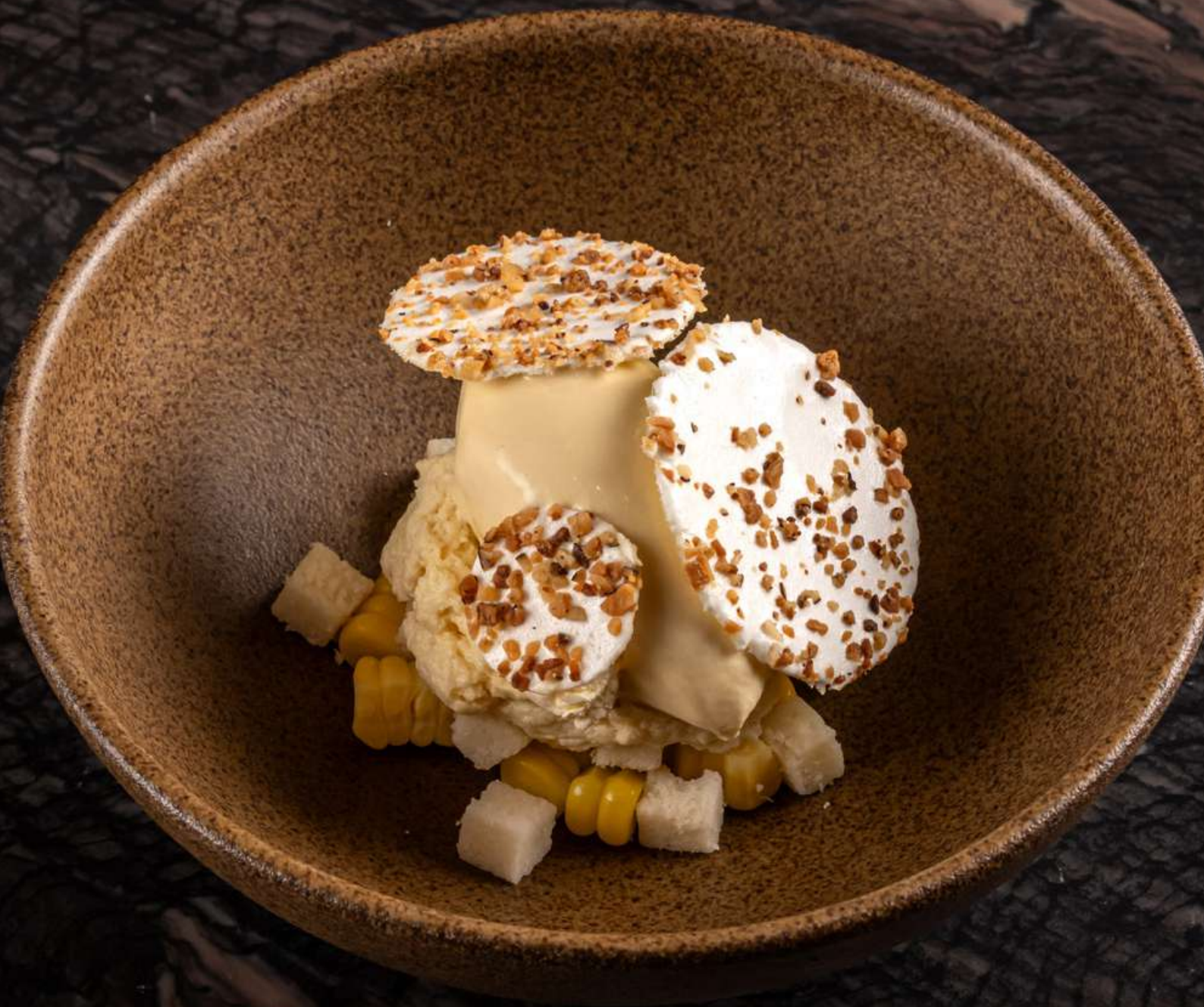
Corn & Coconut Butter Ice Cream ไอศกรีมข้าวโพดและมะพร้าว 260