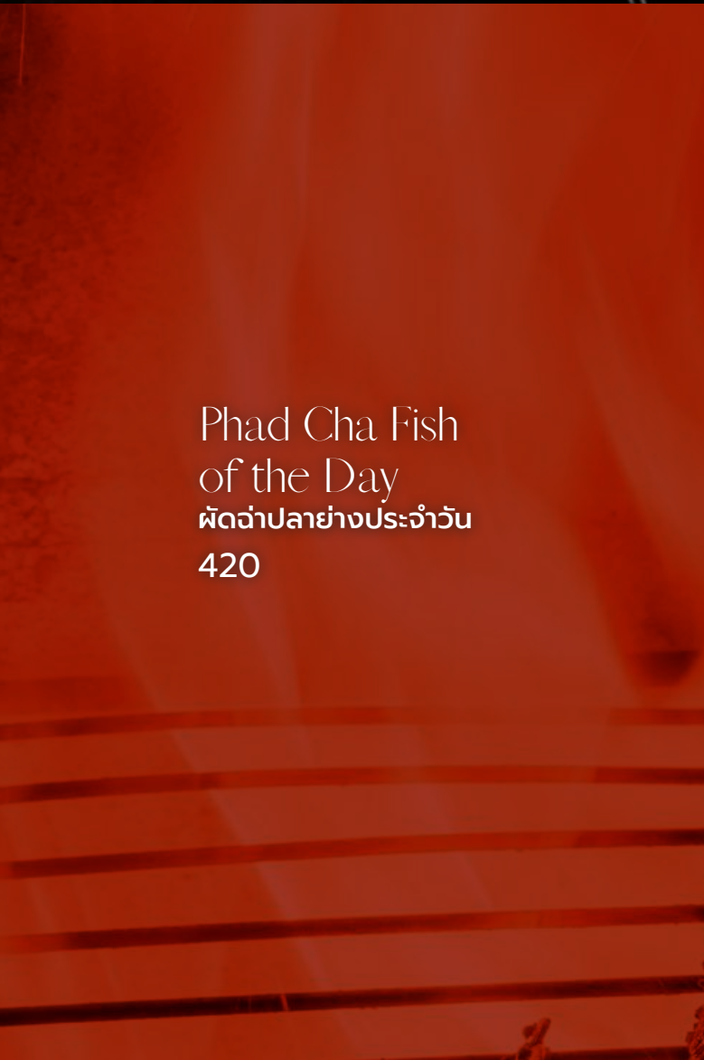
Phad Cha Fish of the Day พัดฉ่าปลาอย่างประจำวัน 420