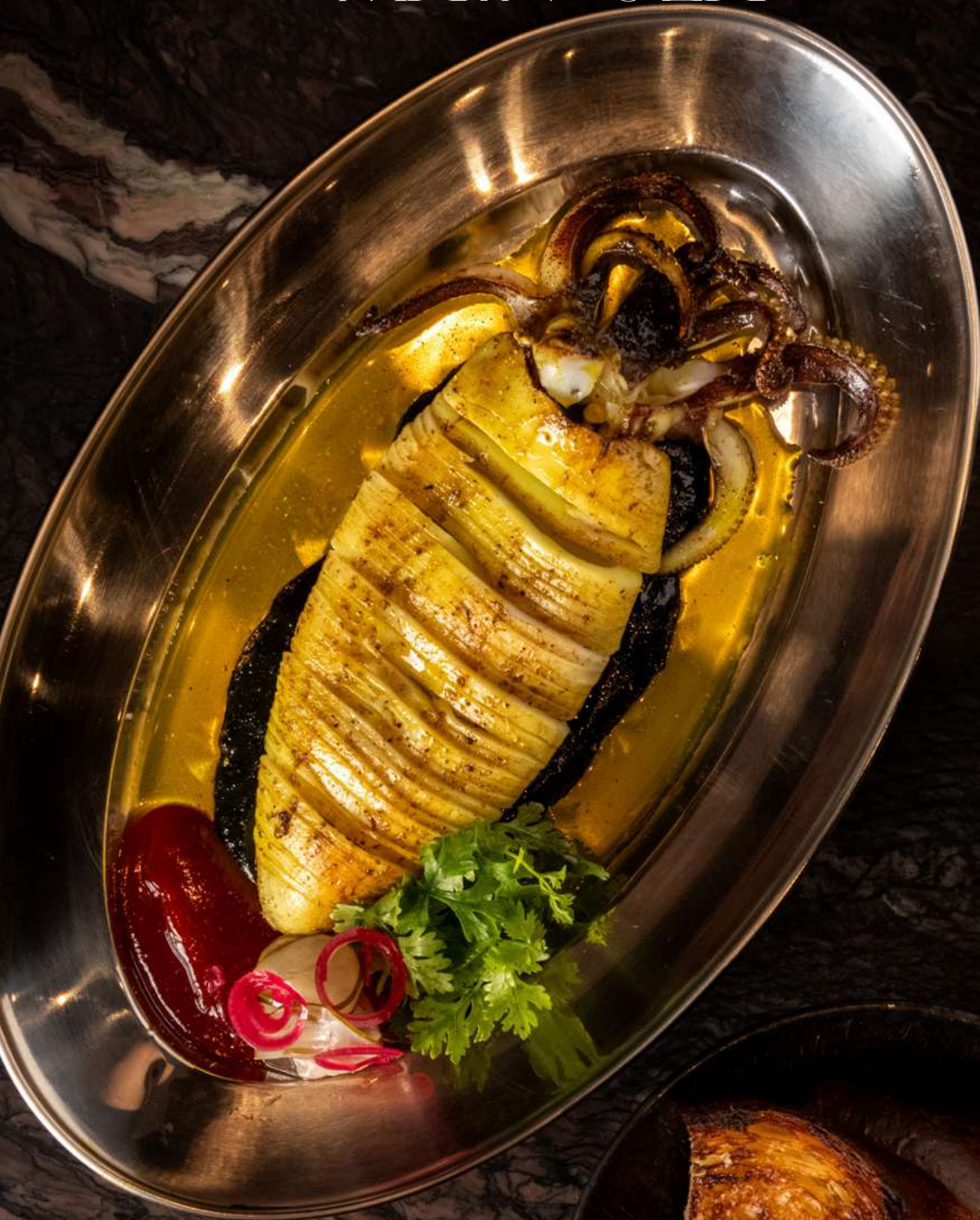
Grilled Satay Marinated Squid หมักเตี๊ยะ 420 / 800