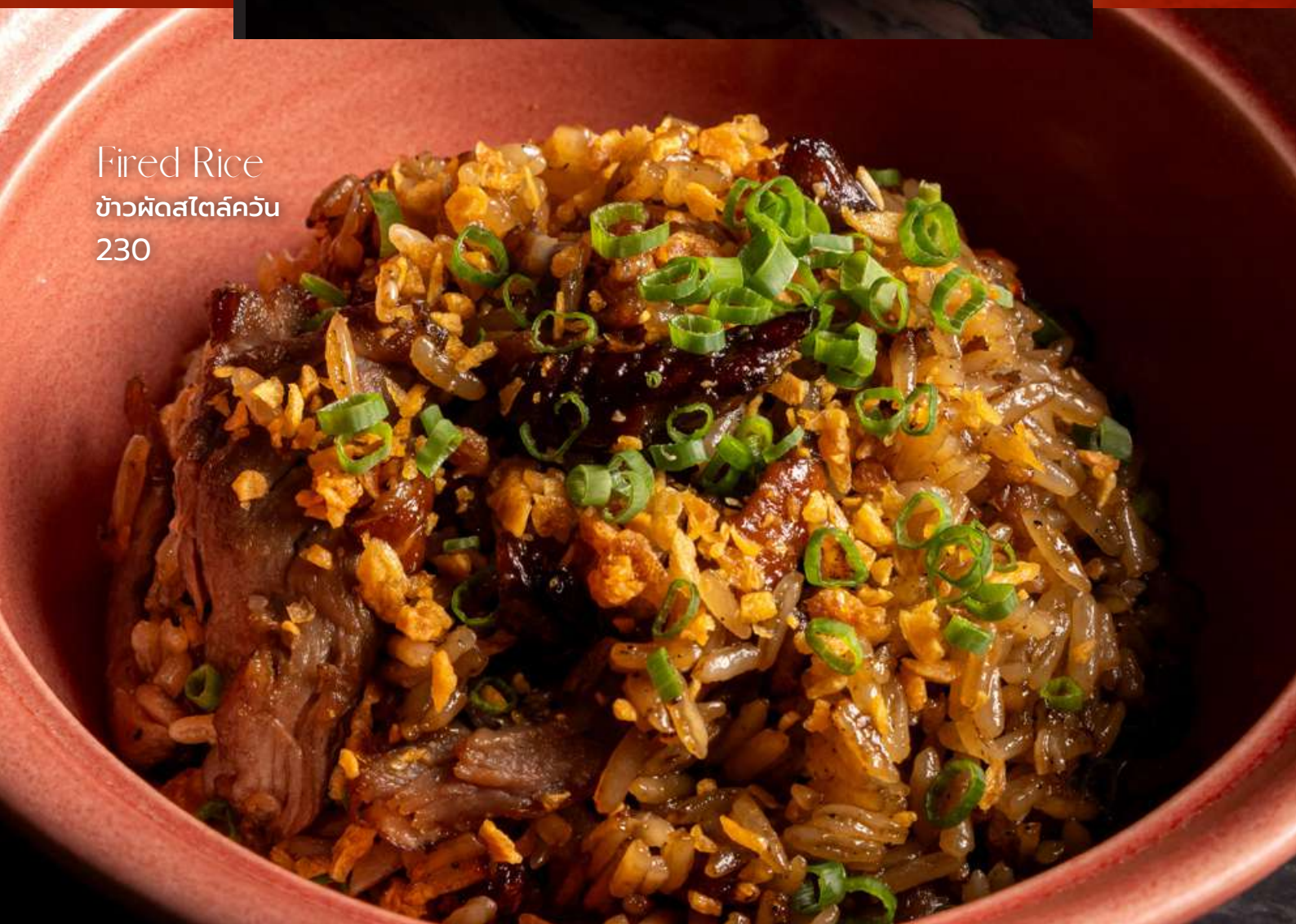
Fired Rice ข้าวผัดสไตล์ค้วน 230