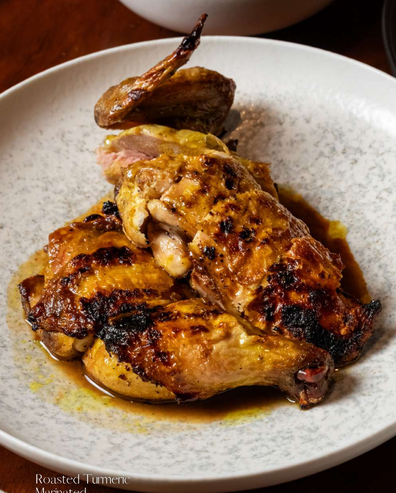
Roasted Turmeric Marinated Chicken Thigh ไกย่างขมิ้น 420