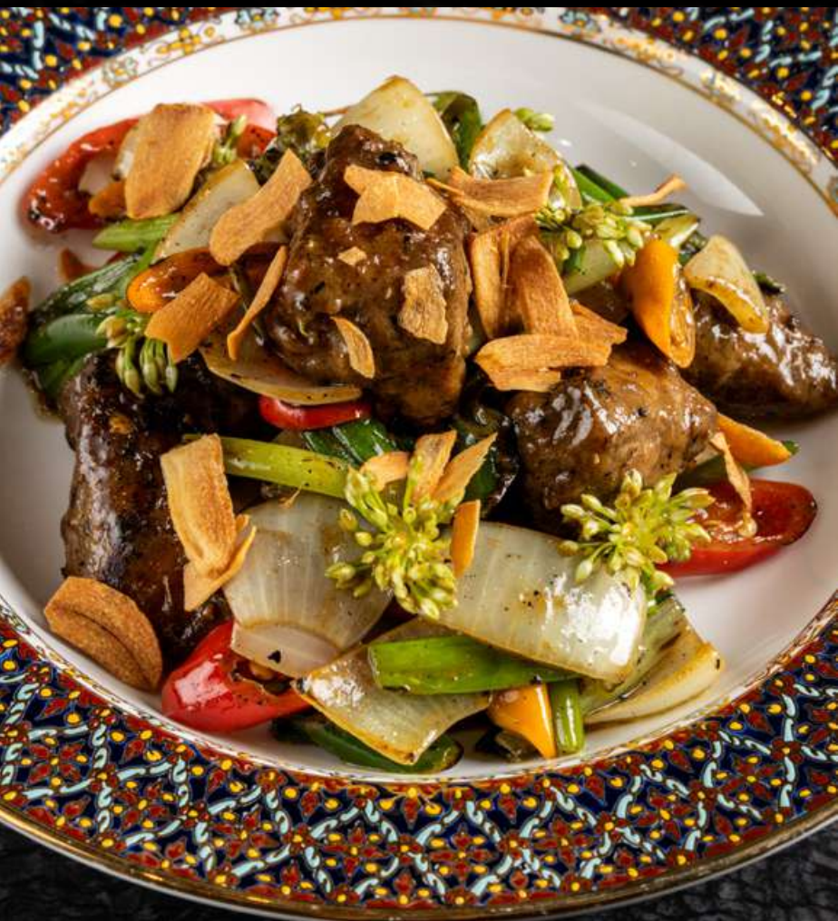
Fire Grilled Beef Hanger เนื้อพัดดอกหอม 420